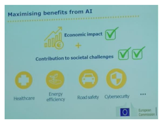
Figure 5: The EU expects that AI progress will bring several benefits, from the economic impacts to solutions to the societal challenges. There are several areas that will see major advances in the near future, such as healthcare.

Several new mechanisms like CLAIRE are already active (https://claire-ai.org/): "an initiative by the European AI community that seeks to strengthen European excellence in AI research and innovation."