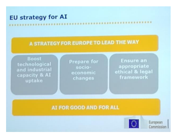
Figure 2: EU strategy involves three elements: science/technology, socio-economic changes and the social framework.

There are two important differences between the USA and the EU: the USA executes bold international policies, whereas the EU finds its soft approach is sometimes hurting its economy and society. The EU used to be no.1 in computer science; now it is no. 3. Lots of this falling behind was not necessary at all; instead there are subjective leadership reasons for the decline, e.g., the EU patent system is enormously complicated and bureaucratic compared to the American one. Another problem: the UK has the best European AI based on many criteria, and so Brexit will make this situation worse for the EU. Whereas top EU projects like H2020 represent world-class research, and the EU is still leading in many areas of business and science, the strong scientific funding for key areas as well as policies to support them are lacking.