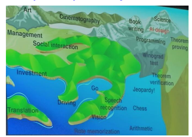
Figure 8: Tegmark's view of the AI field.

https://www.stopkillerrobots.org/2018/07/parliamen ts-2/. The list of institutions supporting the ban is here: https://www.stopkillerrobots.org/coalition/.