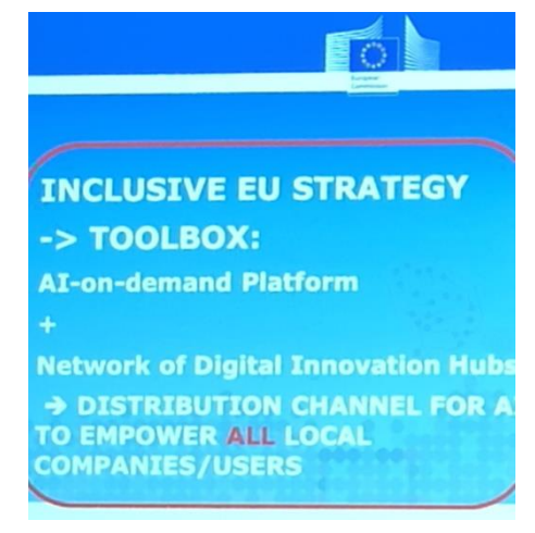
Figure 4: The EU strategy introduces several integrating EU components, including the AI toolbox and the Network of Digital Innovation Hubs. Unfortunately, many of the most advanced AI hubs are in the UK.

A closer look at the EU plan reveals that there are several new ideas, as presented in Figure 4. Among others, the EU will fund the open AI platform, which is at least partially influenced by Elon Musk's, which by the way won the first 5 vs 5 Dota2 game with expert players (some small additional limitations). The EU plan was probably the major AI strategy presented at the conference. While China does it on its own and the USA allocates most funds to military applications, the EU is focused on a public, general, AI-boosting plan to benefit everybody. That is for sure great news, not only for AI in Europe, but for humanity as a whole.