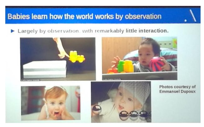
Figure 7: Children learn in a very different way to AI. Why not copy them?

There is shallow, i.e., current AI, deep AI (also claimed as shallow AI), real AI, and fake AI. The last one refers to chatbots, i.e., virtual assistants, where human operators often jump communications and leave users under the impression that it is AI on its own. The real AI was one of the major themes of the conference, which is quite a big difference from the previous conferences, where the primary goal was to complete the tasks better than expert humans, be it chess or detecting malignant tissue patterns. Now the task is different - perform at the level of children aged a couple of years. While supervised learning clearly achieves top performance, compared to humans it needs far too many examples, which is not acceptable, at least for the slow humans. Similarly, reinforcement learning needs way too many trials. Furthermore, machines do not have common sense compared even to young children.