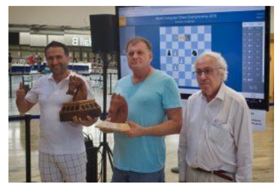
Figure 6: Komodo was again the computer chess champion on PCs. Leela Chess Zero, a PC version of the Alpha Zero, played lucidly, but had no chance against the hard logic of Komodo.

very differently – intuitively, lucidly and errorprone. Obviously, it lacked the power of the Google computers to validate its fancy ideas, often in the form of sacrifices. Figure 6 shows the Komodo team, who received the Shannon Trophy (and replica) from the chairman of the ICGA David Levy.