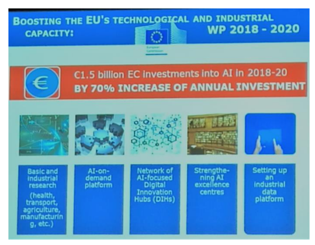
Figure 3: The EU will significantly increase AI funding. Finally. Will national governments follow?

A closer look at the EU plan reveals that there are several new ideas, as presented in Figure 4. Among others, the EU will fund the open AI platform, which is at least partially influenced by Elon Musk's, which by the way won the first 5 vs 5 Dota2 game with expert players (some small additional limitations). The EU plan was probably the major AI strategy presented at the conference. While China does it on its own and the USA allocates most funds to military applications, the EU is focused on a public, general, AI-boosting plan to benefit everybody. That is for sure great news, not only for AI in Europe, but for humanity as a whole.