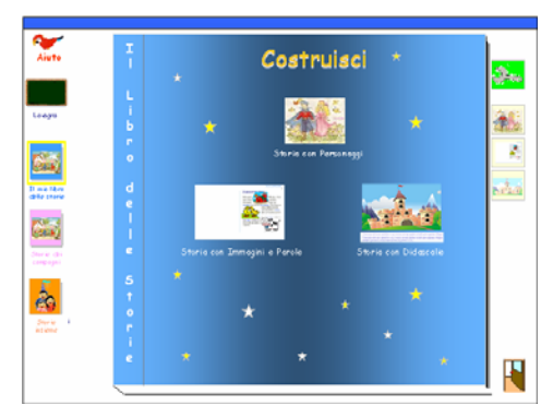
Figure 5: My Stories "Construct" menu.

Three approaches for constructing one's book of stories can be chosen directly in the "Construct" menu.