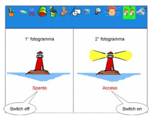
Figure 8: a graphic representation of an antonym.

possible to represent graphically the meaning of certain kinds of antonyms, such as "close/open", "switch on/switch off" etc.).