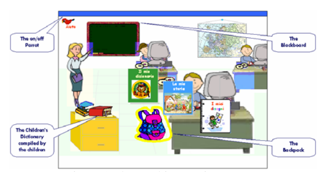
Figure 2: the working environments.

From his/her book of stories or a drawing album, however, the pupil can always access his dictionary in order to insert new words and/or images as well as for a consultation.