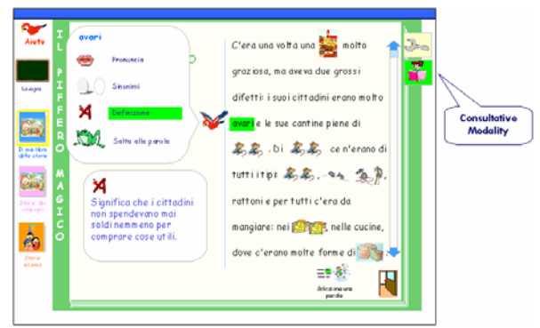
Figure 7: "The Magic Pipe" (Consultative Modality).

By selecting the button "Make the word jumping" (which is symbolized by a Frog and represents the link between My Stories and My Dictionary), the user can verify if the word selected is or is not present in his dictionary and, in the negative case, he can insert the word selected in his dictionary.