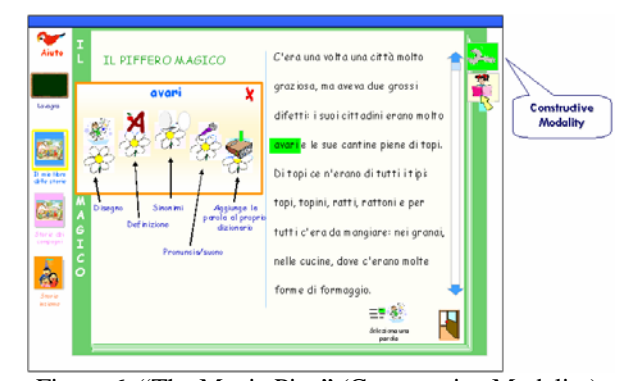
Figure 6: "The Magic Pipe" (Constructive Modality).

The construction and the possible consultation of a story facilitated by the use of images and words can be illustrated with the example reported below ("The Magic Pipe").