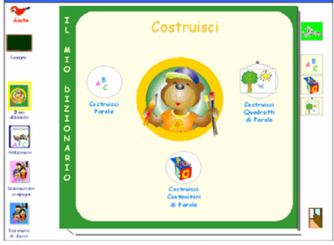
Figure 4: My Dictionary "Construct" menu.

Moreover, My Dictionary is the ideal environment in which many of the activities that can be carried out are such that they can be performed in a cooperative manner. Three of the approaches for constructing one's dictionary can be chosen directly in the "Construct" menu.