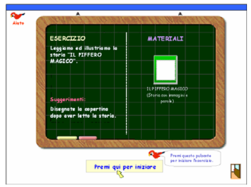
Figure 3: the Blackboard .

Collaborative activities can be proposed by the teacher through the Blackboard , which can be considered as the fifth working environment of AddizionarioPLUS in every respect.