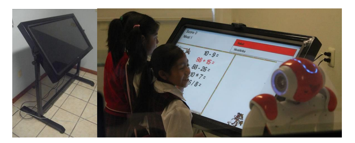
Figure 1. Setup of the games. Left, custom games stand set at 45 degrees and, right, children playing the games with a robot assistant.

Developing these skills at the same time as they learn to use new technologies should also allow the students to develop a more wholesome relationship with technology and suffer less from adverse effects such as isolation and retarded social skills [13, 38].