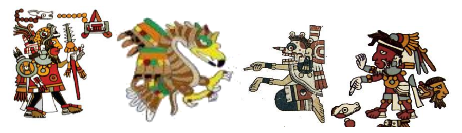
Figure 2: Mixtec codices used as characters in the mathematics and languages videogames: Jaguar, eagle, muerte and mixteco.