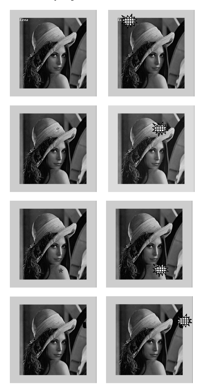
Figure 3: Lena with location of tampered blocks.

To demonstrate the ability of the proposed scheme in locating the blocks that have been intentionally tampered, the watermarked Lena image has been intentionally tampered by introducing small patches. In one case, a text has been placed at the top left corner of Lena, Fig. 3 (a), and the method correctly located the tampered blocks as shown in Fig. 3 (b). Patches were introduced at other points on Lena. In all the cases this technique correctly identified malicious tampering.